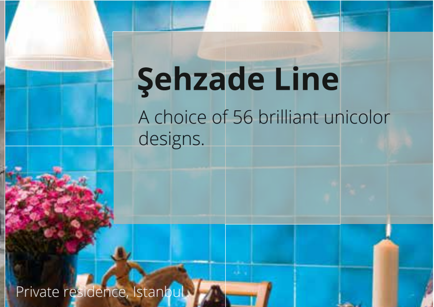
Private residence, Istanbul