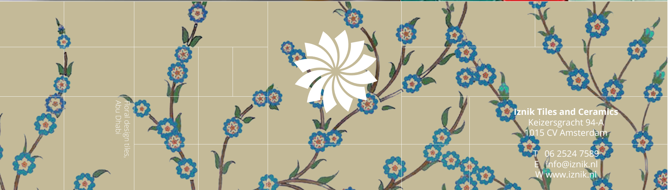
Floral design tiles, Abu Dhabi

Iznik Tiles and Ceramics Keizersgracht 94-A 1015 CV Amsterdam