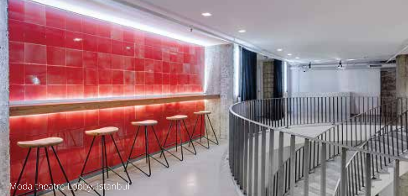
Moda theatre Lobby, Istanbul